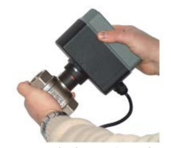
Manual valve opening and closing possible, in case of a power failure