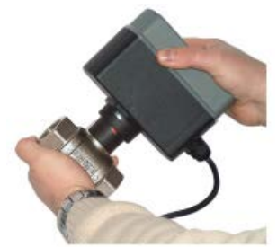
Manual valve opening and closing possible, in case of a power failure