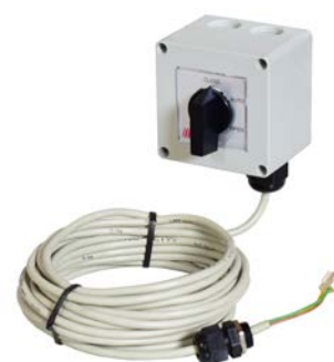
Remote control option

Brass valve, nickel plated. Manual valve opening and closing possible, in case of a power failure