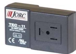
Private labelling options