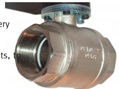
Brass, nickel plated valve

JORC is NEN - EN - ISO 9001:2015 certified