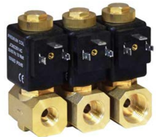
Various valve connection options