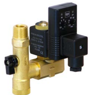
Accessories include ball valve strainers