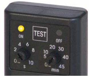
Bright LED's, indicating operating status