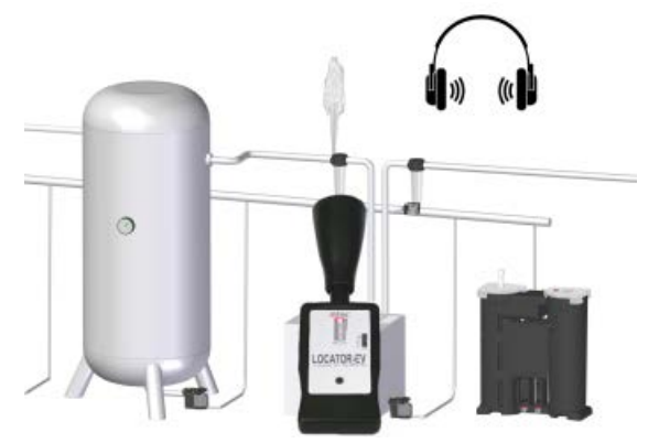
Visual and audible leak indication