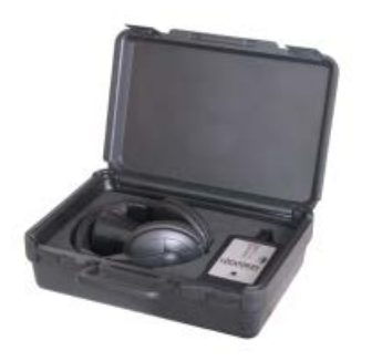
Supplied in a protective case, complete with headset and focusing probe