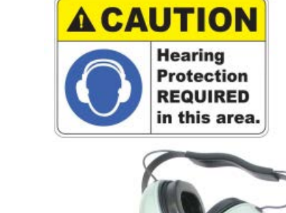
Hard-hat headset optionally available