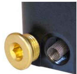
Integrated mesh strainer; protects the valve against large contaminants