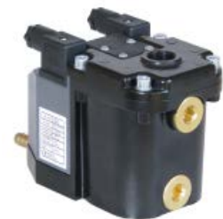
Three inlets offering installation flexibility

JORC is NEN - EN - ISO 9001:2015 certified