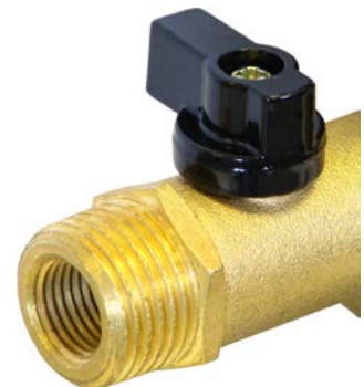
Dual inlet feature 1/2" & 1/4"