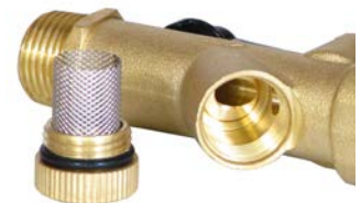
Integrated mesh strainer

JORC is NEN - EN - ISO 9001:2015 certified