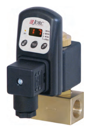
Also available in a FLUIDRAIN valve version