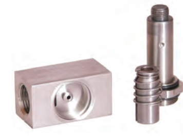
Stainless steel valve options, offering you solutions in niche markets