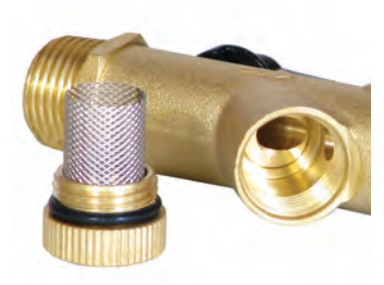
Integrated mesh strainer