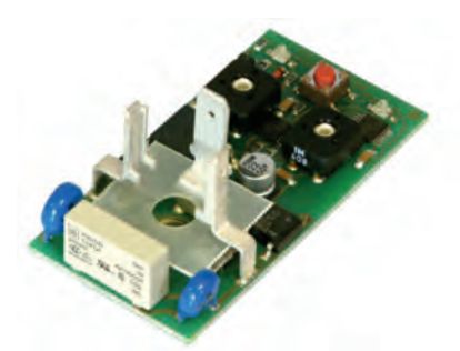
Highest quality PCB

o.5 – 10 seconds / o.5 – 45 minutes SMD technology, ensuring consistency in production Bright LED illumination