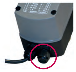
Remote switch feature