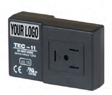
Private labelling available