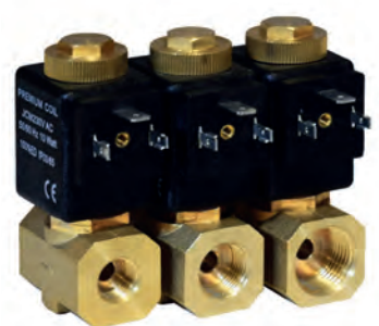
Various valve connection options

o.5 – 10 seconds / o.5 – 45 minutes SMD technology, ensuring consistency in production Bright LED illumination