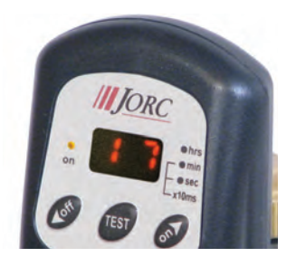
Visual display of current operating cycle

o.o1 second to 99 hours (both ON and OFF) SMD technology, ensuring consistency in production Bright LED illumination