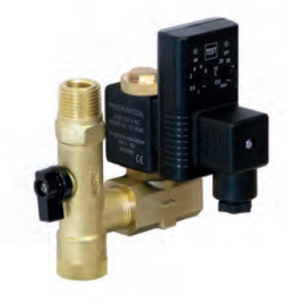
Accessories include ball valve strainers