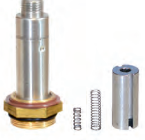
Service kits available