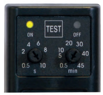
Bright LED illumination, indicating operating status