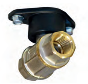
Brass nickel plated valve

7 seconds to 15 minutes ON / 4 minutes to 24 hours OFF SMD technology, ensuring consistency in production Bright LED illumination