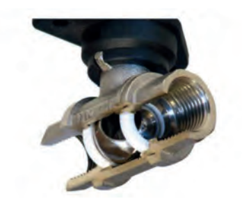
Stainless steel rotating ball