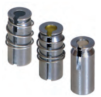
The right seal for the right job