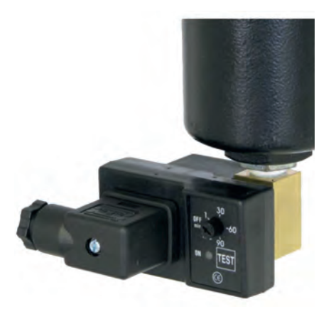
Inline installation under compressed air filters