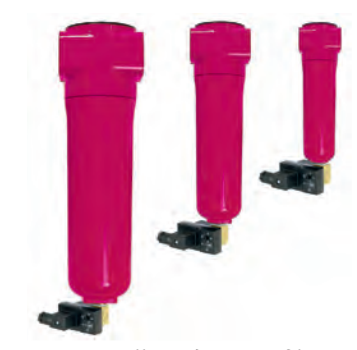
Install under any filter