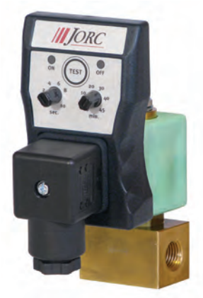
Environmentally friendly low Watt version available