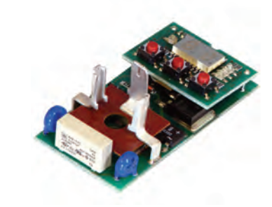
Digital processor, offering you exceptional time cycle accuracy