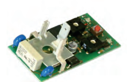
Highest quality PCB

0.5 - 10 seconds / 0.5 - 45 minutes SMD technology, ensuring consistency in production Bright LED illumination