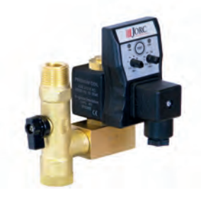
Accessories include ball valve strainers