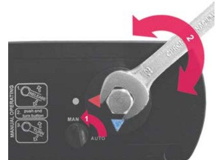
Manual valve opening and closing possible, in case of a power failure