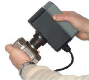
Manual valve opening and closing possible, in case of a power failure