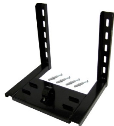
Wall mounting bracket