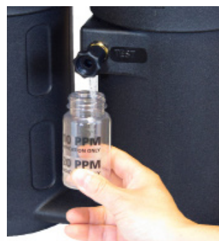
Routine testing feature included