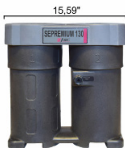
Small foot print