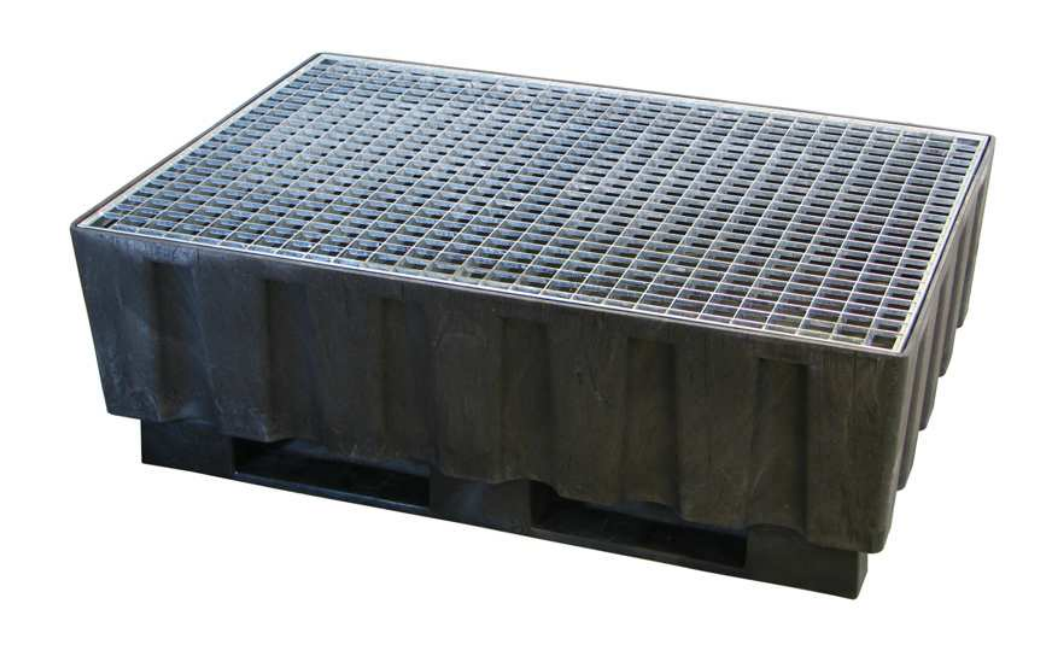
Installation Instructions 8-2020